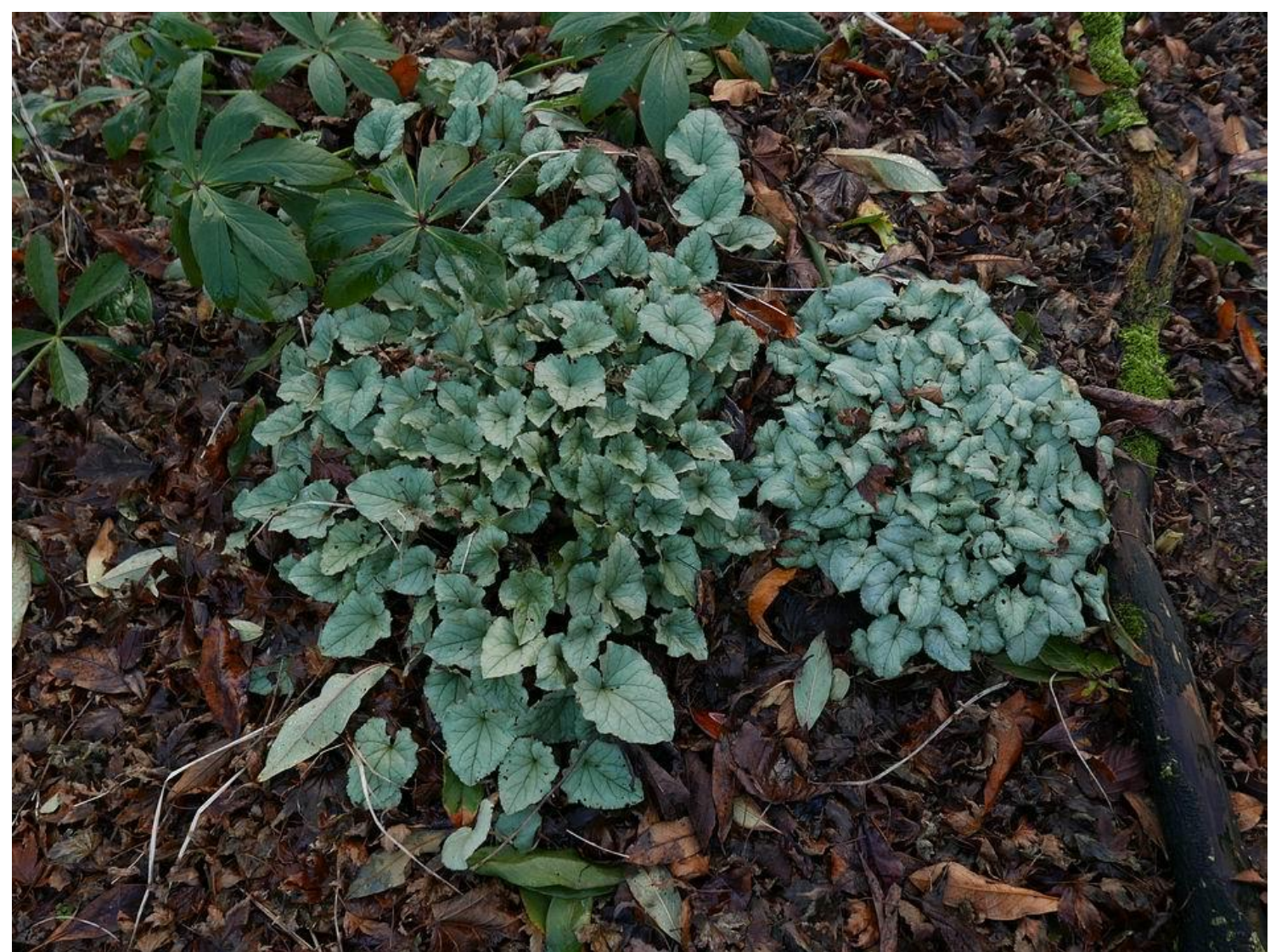
Here again are hellebore leaves which I will soon remove to make way for the new spring growths. This form of Cyclamen hederifolium has lovely silver-grey leaves which emerged a few months ago after the flowers and will add decoration until next summer.