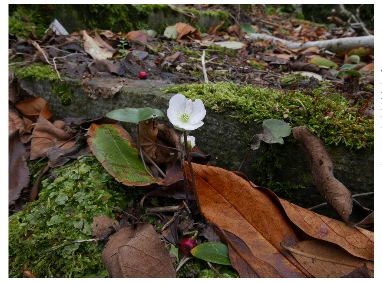
Tempted out by the mild weather we have a few Hepatica flowers taking their chances well ahead of the main flowering which will occur in a few moths time.