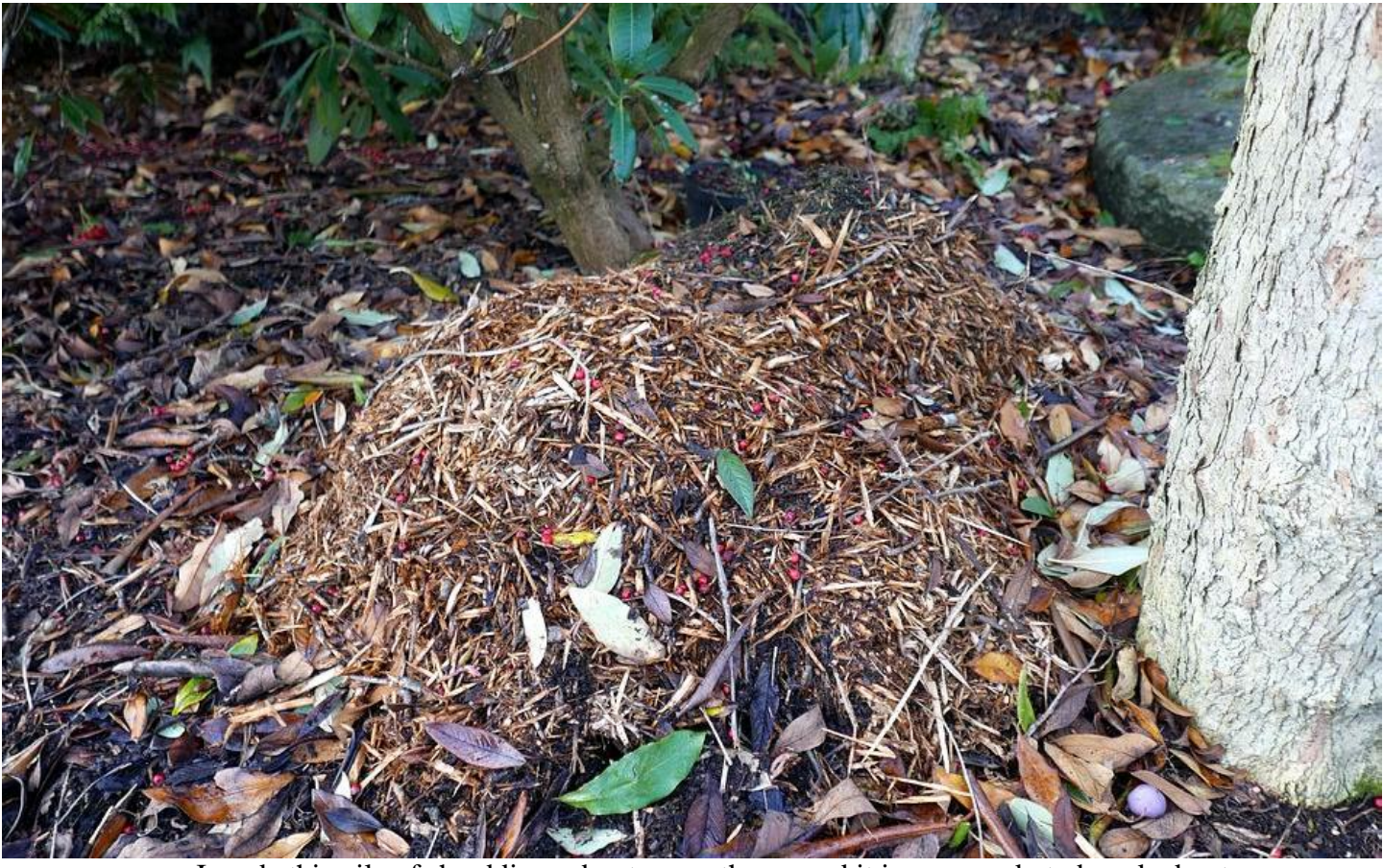
I made this pile of shreddings about a month ago and it is now ready to be raked out.