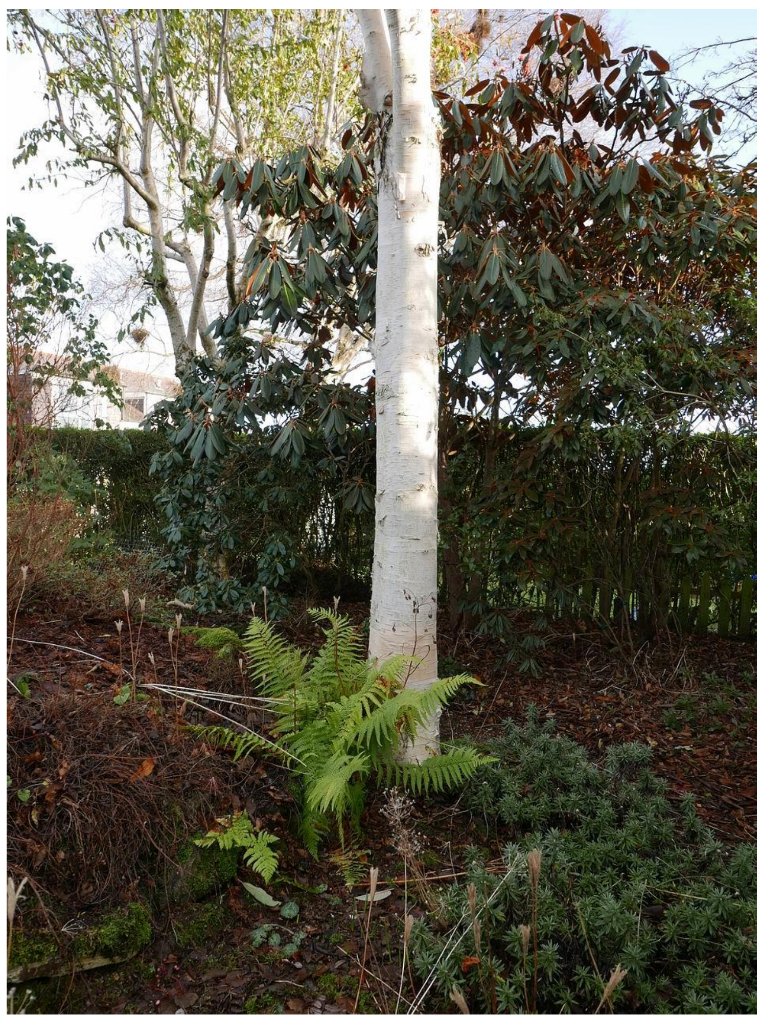
Betula utilis var. jacquemontii stands proud in the garden and is one of the trees that I will be reducing the canopy of during January.

Once again I thank Len Rhind for his work in keeping the <u>Bulb Log Index</u> updated and generously making it available to everyone – click the link for the latest version.