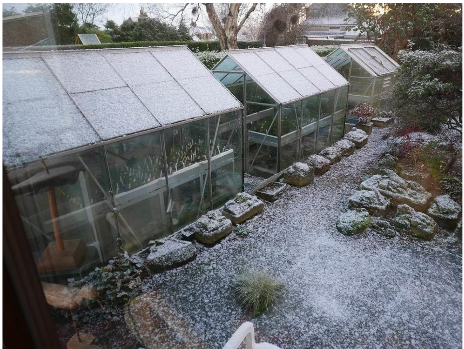
When the weather swings back to winter I can retreat into the glasshouses where strangely much of the flowering is not so advanced.