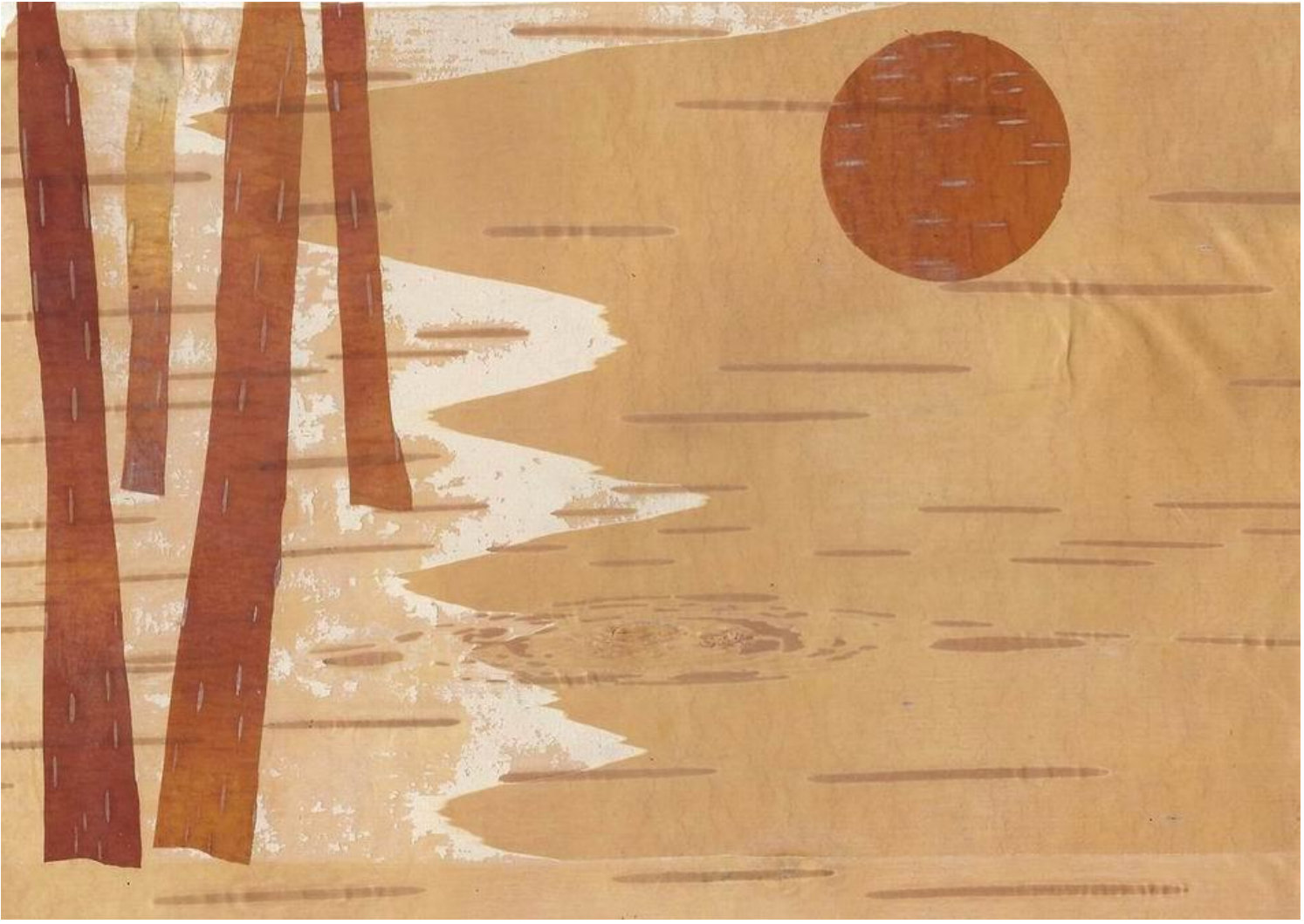
Betula utilis landscape – bark collage.

away so decided to enhance them a little with bits from the contrasting red barked form to create the small collage below which I posted on Facebook as my New Year image.