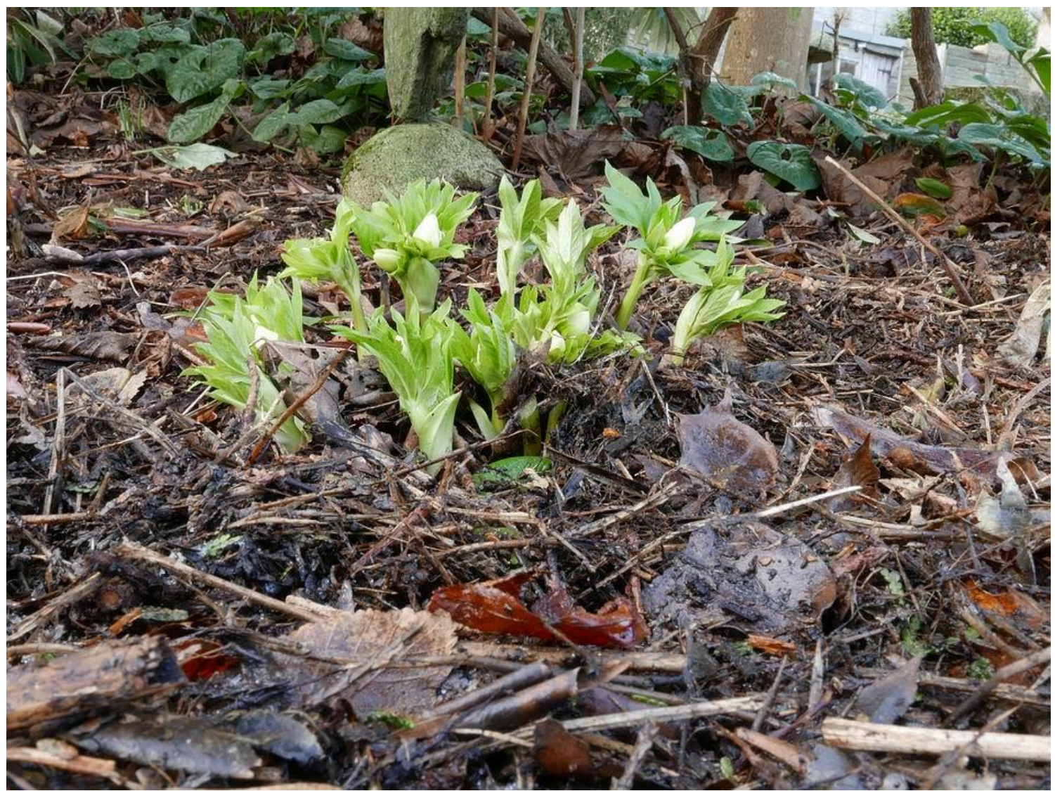
With the old leaves removed the new growths and surrounding plantings will get plenty of light, also you will see below that I have started to spread a mulch across this bed.